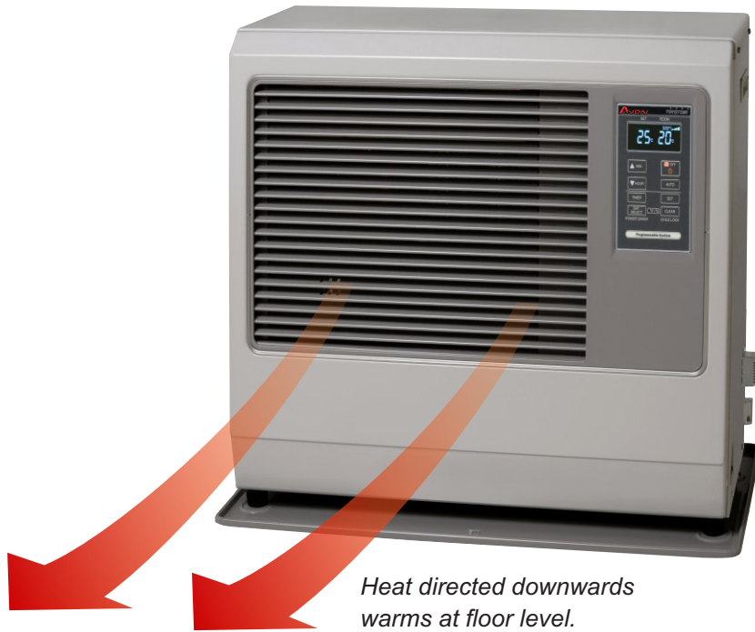
Heat directed downwards warms at floor level.

Safe, Convenient & Easy to use - no mess, no fuss.